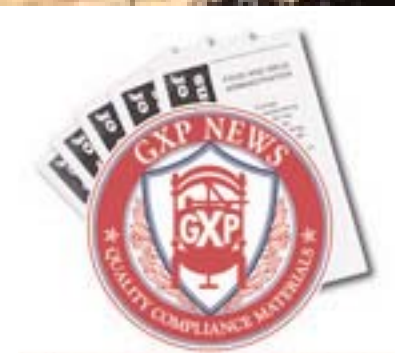
GXP News for Regulated Industry